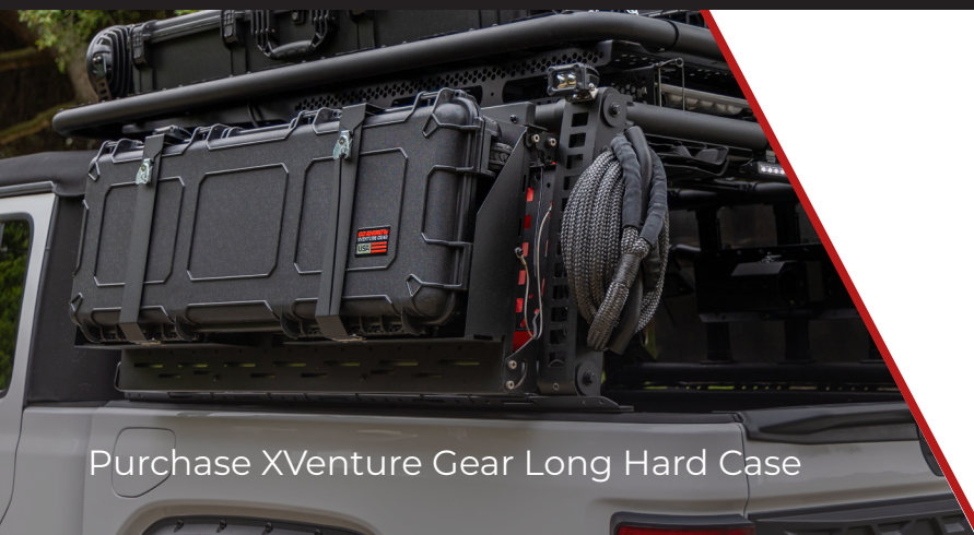
Purchase XVenture Gear Long Hard Case

Purchase one of the following qualified products from August 29, 2024 to October 31, 2024 and receive a free product via rebate.