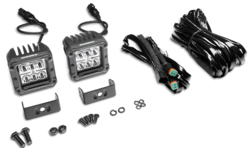
Receive 3-inch LED Cube Lights

Offer Valid August 29, 2024 - October 31, 2024. Consumer Promotion. Valid in U.S. Limit one per household. Submit rebates at realtruckrebates.com .