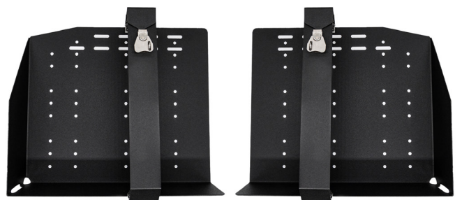
Receive mount for XVenture Gear Long Hard Case