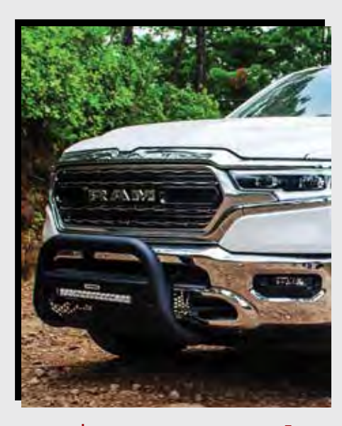
$25 eRewards RC2 w/ GR Lights 2, 4 & 20" Single Row