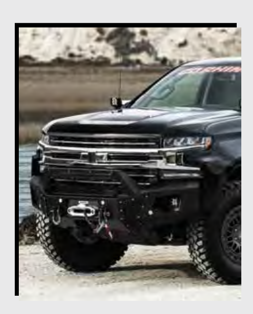
$100 eReward All Front & Rear Bumpers For Truck