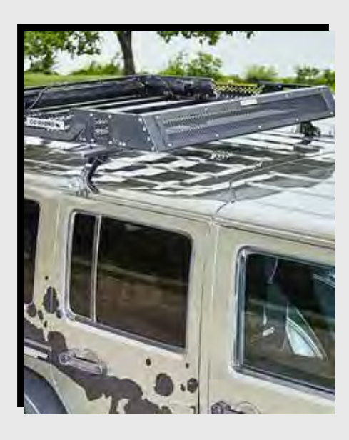
$50 eRewards SRM100 Roof Racks