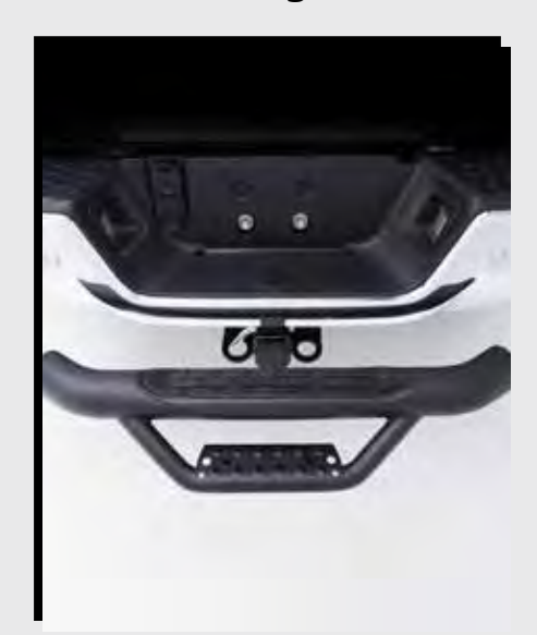
$10 eRewards Dominator Hitch Steps