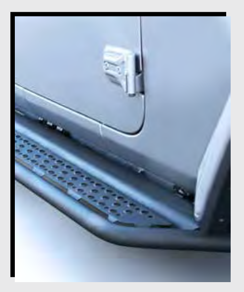
$50 eRewards Dominators Side Steps - D1, D2, D3, D4, D6, DS, DSS