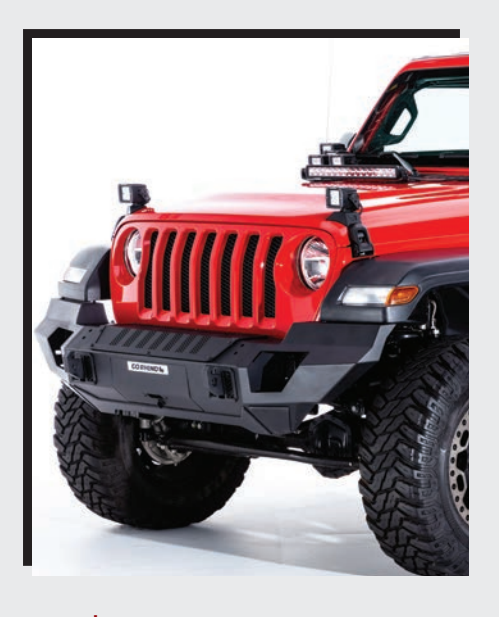
$50 eRewards Jeep Trailline® Front Bumpers