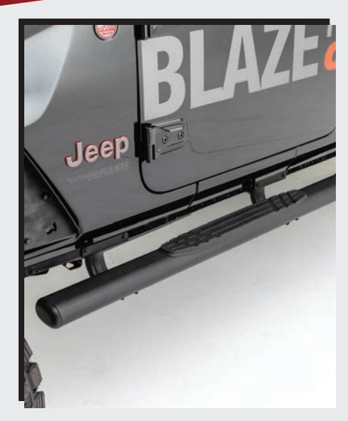
$25 eRewards 1000 Series 4" or 5" Side Steps