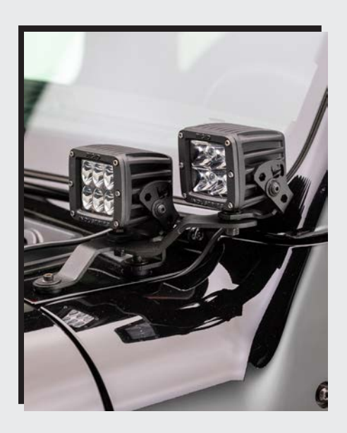
$10 eRewards Light Mounts for Jeep