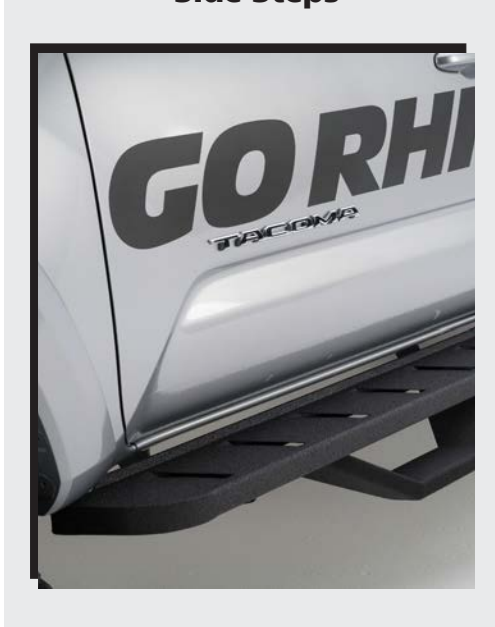
$50 eRewards RB10 Running Boards with drop steps