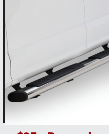
$25 eRewards OE Xtreme Composite 5" Side Steps