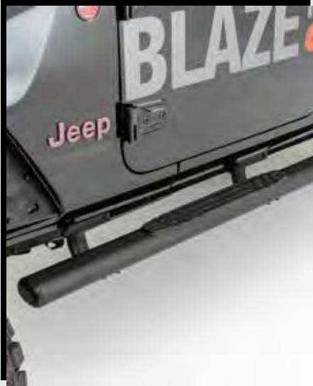
$25 eRewards 1000 Series 4" or 5" Side Steps