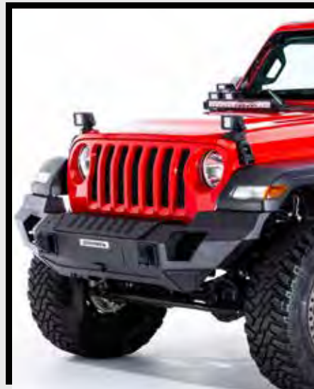
$50 eRewards Jeep Trailline® Front Bumpers