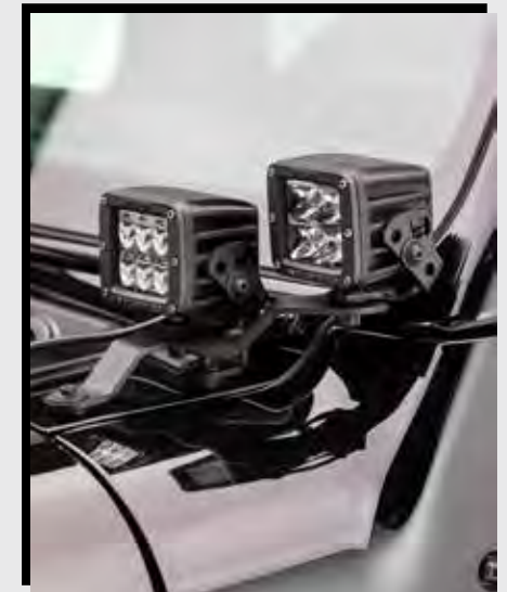
$10 eRewards Light Mounts for Jeep