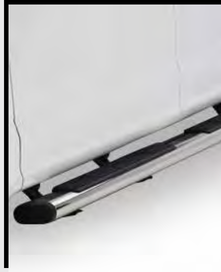
$25 eRewards OE Xtreme Composite 5" Side Steps