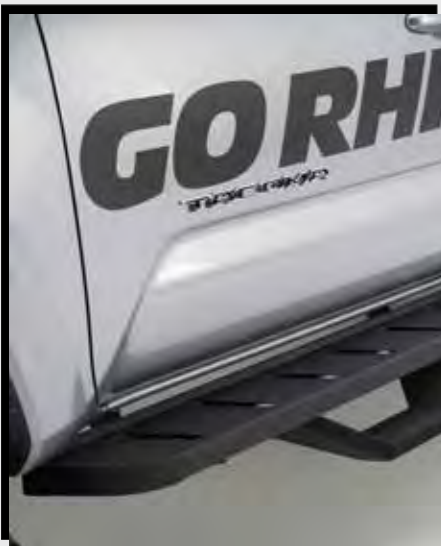
$50 eRewards RB10 Running Boards with drop steps