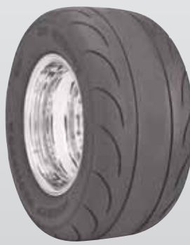
ET Street® Radial DOT Drag Radial