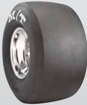
ET Drag® Bias Ply Drag Slick