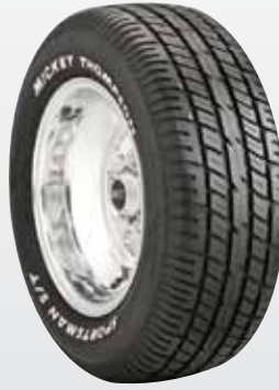
Sportsman S/T™ Radial White Letter for Muscle Cars and Trucks