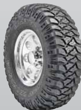
Baja MTZ™ Mud Terrain Radial