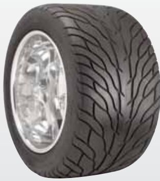
Sportsman S/R™ Radial Street Rod Tire Wide Rears, Skinny Fronts