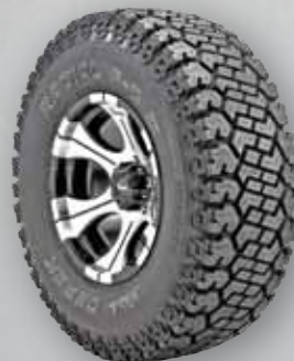
Radial F-C II All Terrain Radial