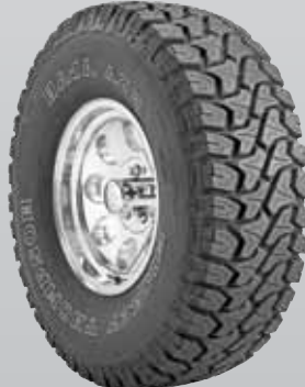
Baja ATZ™ All Terrain Radial