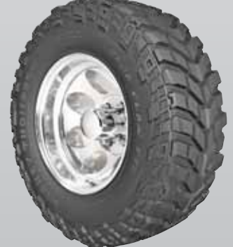
Baja Claw® TTC Extreme Terrain Radial