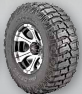
Crusher Extreme Terrain Radial