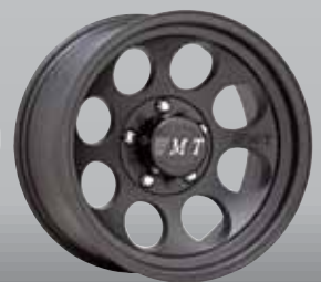
Classic II™ Black