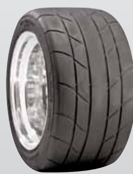
ET Street® Radial II DOT Drag Radial