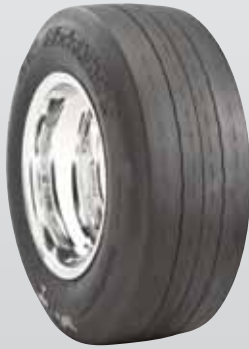
ET Street® Bias Ply DOT Drag Tire