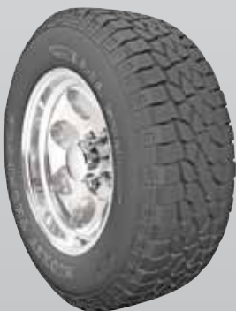
Baja STZ™ Street Smart All Terrain Radial OE Replacement Sizes