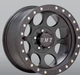
Classic Lock™ Black