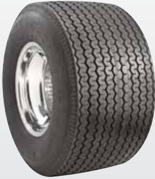
Sportsman Pro® Bias Ply Classic Street Rod Tire