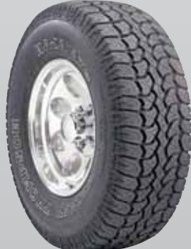
Baja ATZ™ Plus All Terrain Radial