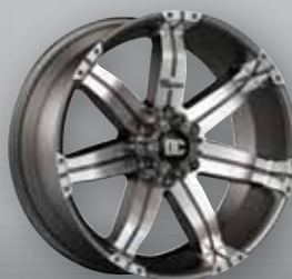
Gun Metal 7