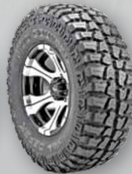
Mud Country Mud Terrain Radial