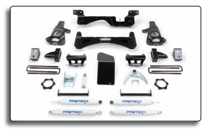
6" Budget System w/ Performance Shocks