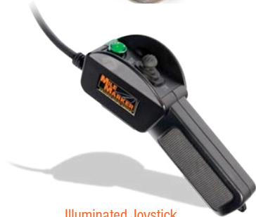
Illuminated Joystick Remote Control