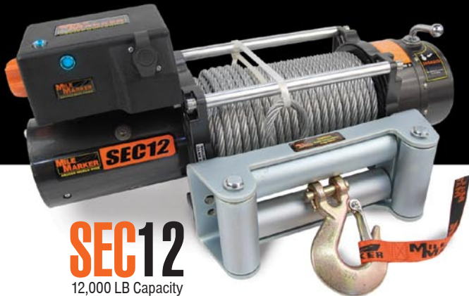
SEC12 12,000 LB Capacity PN: 76-50251