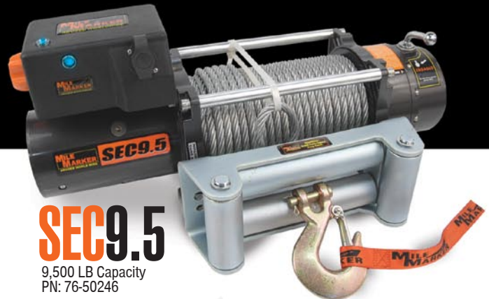
SEC9.5 9,500 LB Capacity PN: 76-50246