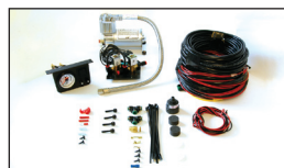
25651 LoadCONTROLLER I Dual Path

Thank you for your interest in Air Lift Products! For more information, please call (800) 248-0892