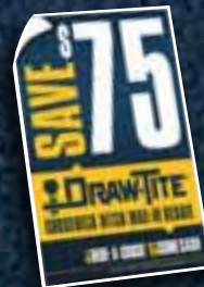
Rebate Attachment for Showroom Display