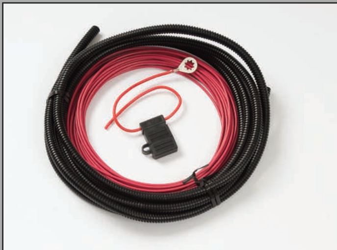
Battery Wiring Kit #235040