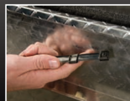
Toolbox Kit includes battery power pack (batteries not included)