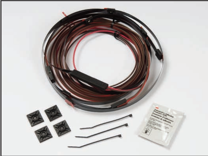
LED Truck Bed Lighting Kit #235010