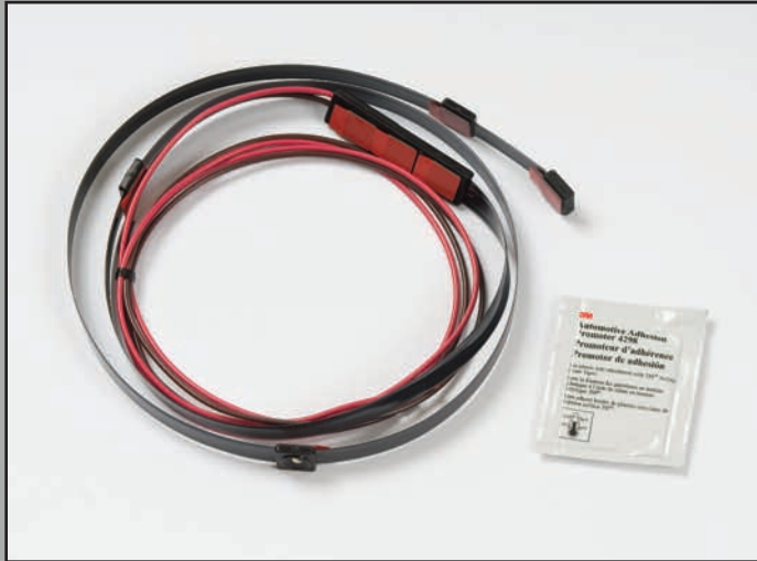
LED Single Strip Lighting Kit #235020