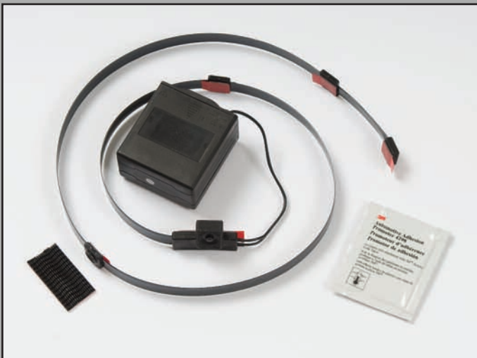
LED Toolbox Lighting Kit #235030