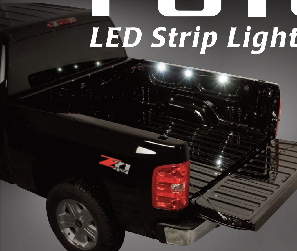
LED Truck Bed Lighting Kit