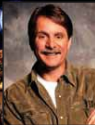
Keynote Entertainer Jeff Foxworthy